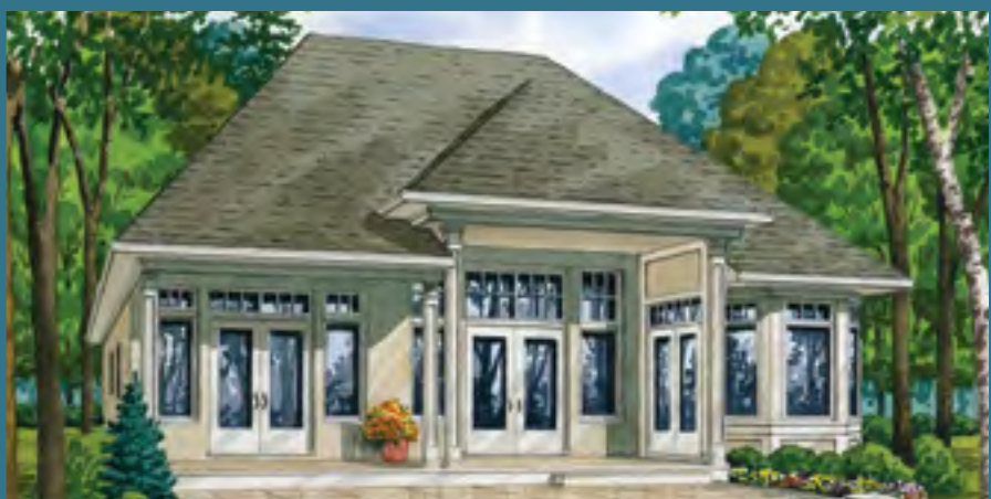
ARTIST'S CONCEPT OF THE REAR